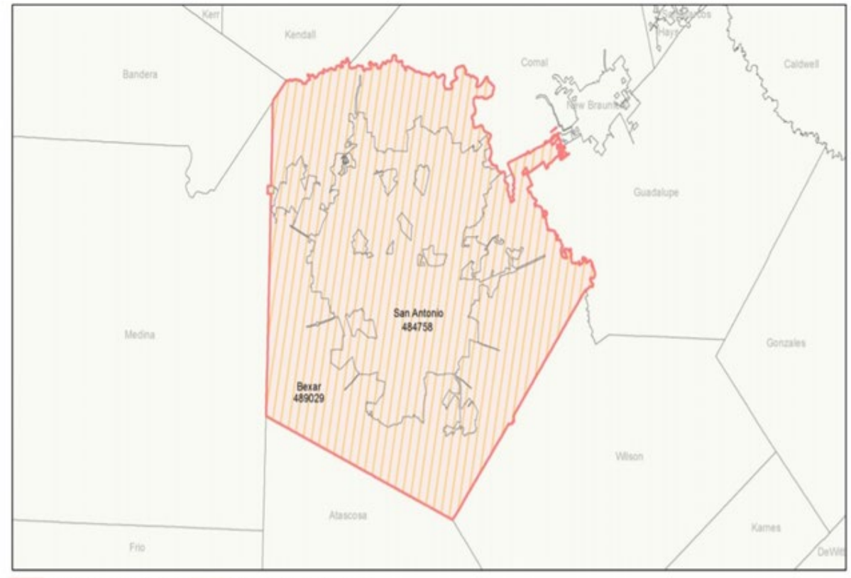
2016 CoC Boundary 111 2015 CoC Boundary